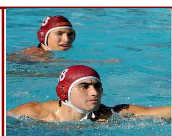
Boys Water Polo

Boys Water Polo continued a streak of three straight years with a CIF Playoff appearance and finished the season ranked #8 according to LA Daily News